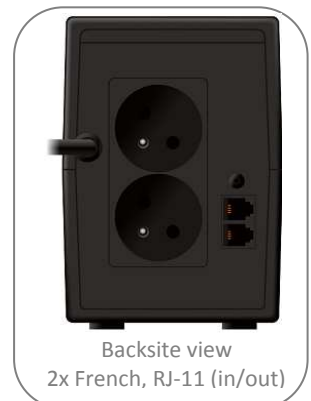
Backside view 2x French, RJ-11 (in/out)